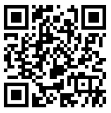
Check To See If You Are Registered To Vote