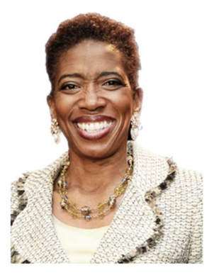
Carla Harris Leading Woman Award