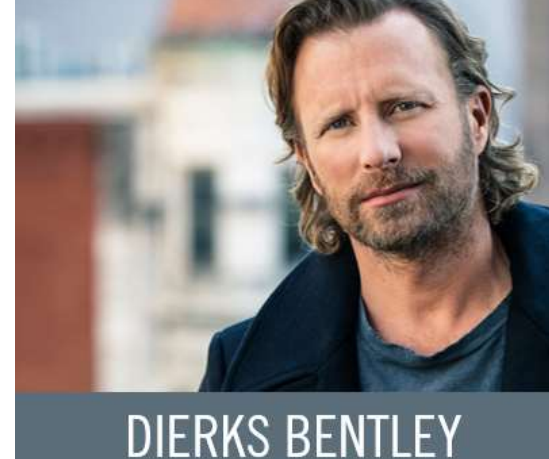
American Country Singer and Songwriter